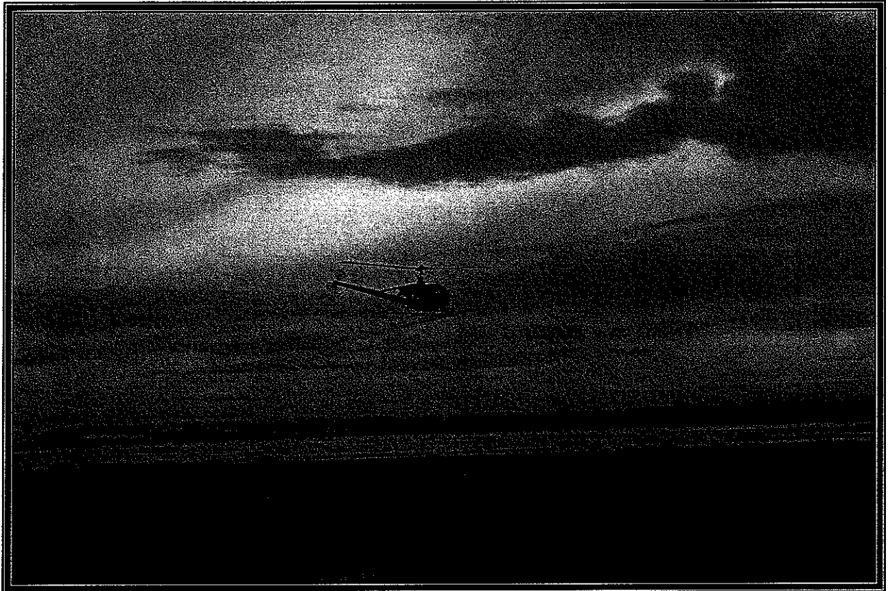
Aerial application in Willapa Bay during the 2007 treatment season.